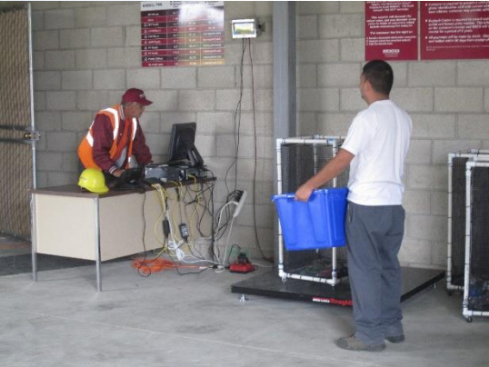
6 State Certified Recycling Buyback Centers