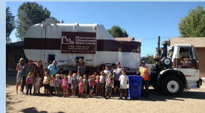
Elementary School Presentation