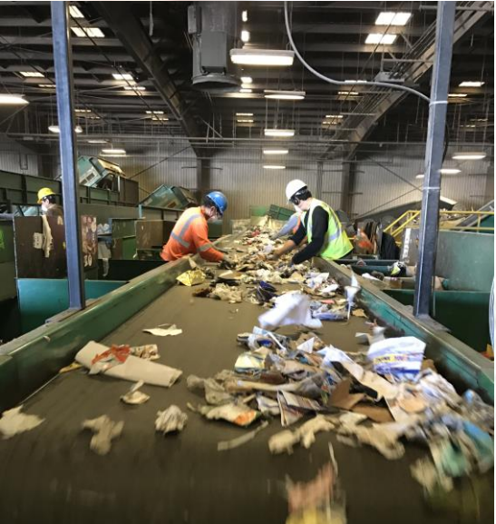
2 Material Recovery Facilities (MRF's)