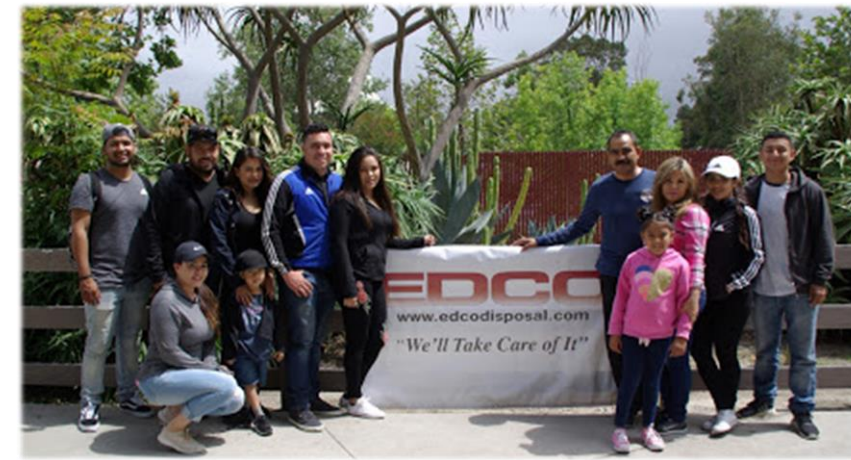
Family Day Event