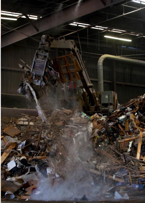
2 Mixed Construction Demolition and Inert (CDI) Processing Facilities

Since 1967, EDCO has embraced Zero Waste as the goal and is committed to continually reinvest in this path.