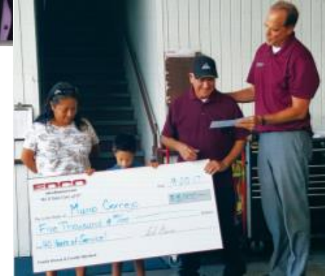
20 and 40 Year Celebrations