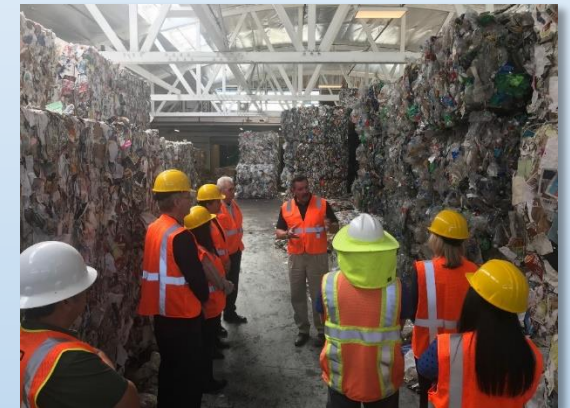
Tour of Material Recovery Facility