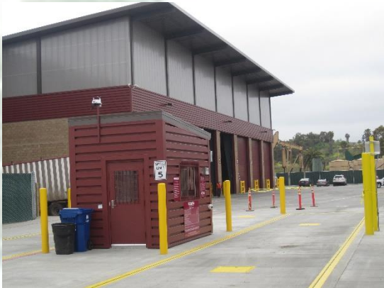
6 Transfer Stations