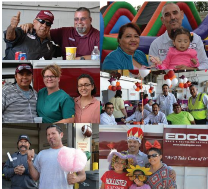
Founders Day Celebration